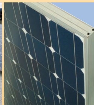
The NU-U240F1 offers industry-leading performance for a variety of applications.